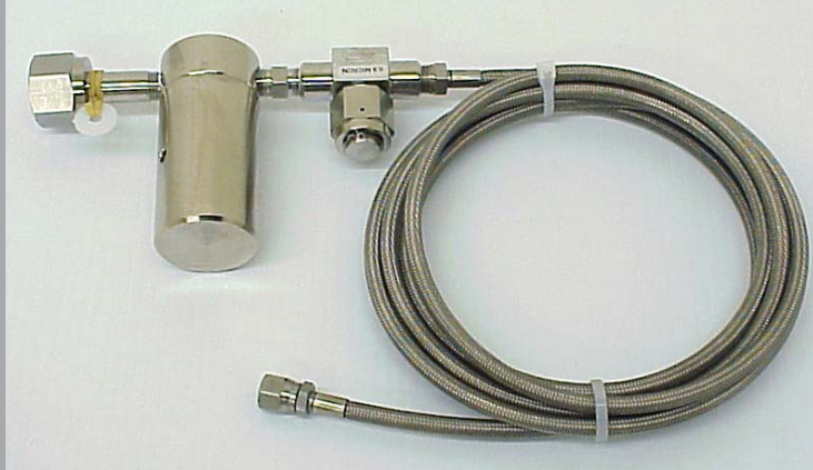
# 8784 LCO 2 Filter Housing with # 8760-34 CGA - 320 S.S. Coupler & # 8770-33 High Pressure Hose (10ft)