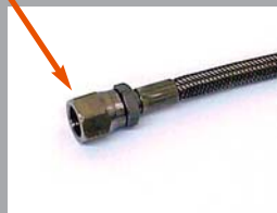
High Pressure Hose to SAMDRI®